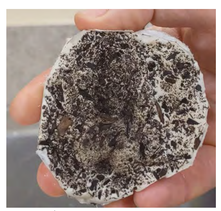
Raccoon track cast