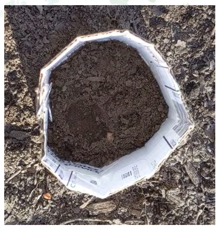
Taking a raccoon track casting.